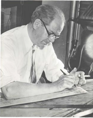
Ding sitting at his desk, drawing.