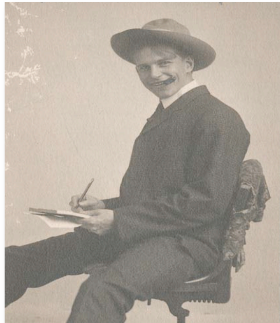
Ding Darling while working at the Sioux City Journal in Iowa, 1904.

Jay graduated from Beloit College in 1900 and immediately started looking for a job that would help him pay for medical school. At the age of 23 he began work as a cub reporter for the Sioux City Journal ; and though his dream was to become a doctor, Darling's talents directed him otherwise. His first drawing was published in the Journal after a lawyer refused to let the young reporter take his picture, so Darling drew a picture of the attorney instead. The sketch was so popular that Jay's boss asked him to do a whole series of caricatures depicting the city's leading figures. From there, Darling started drawing political cartoons; and in less than four years the artist was also drawing attention from across the state of Iowa... and the idea of medical school faded into the background.