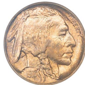
A 1913 Buffalo Nickel, also known as an Indian Head Nickel.

President Franklin Roosevelt hand-picked Darling to serve on a government committee. Early in the 1940's, J.N. teamed up with Governor Spessard Holland of Florida to save a plot of land from developers. Then in 1945, Darling urged President Harry Truman to turn that same piece of land into a National Wildlife Refuge. The cartoonist was also friends with James Earl Fraser , the artist who sculpted the Indian head on the Buffalo Nickel.