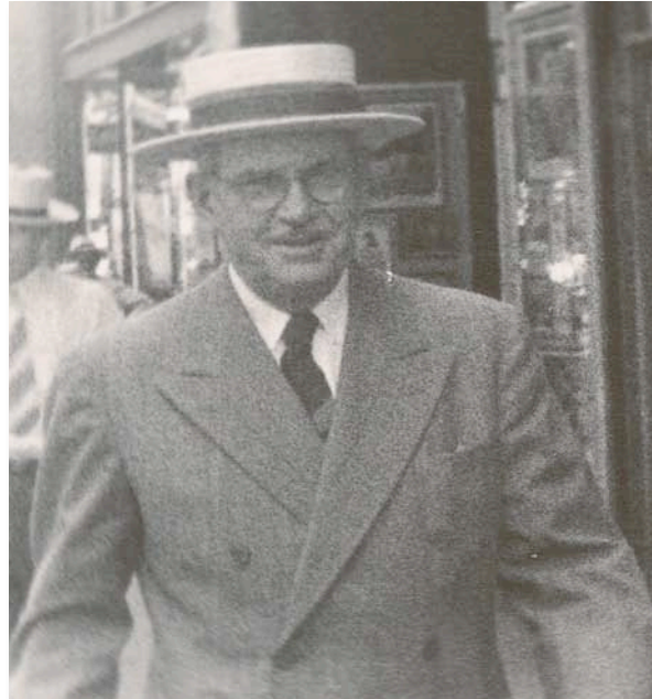
Ding Darling dressed up.