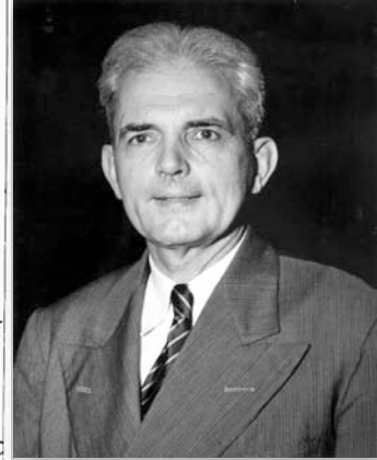
Above: Former FL Governor, Spessard Holland, 1946. At left: Cartoon drawn by Ding welcoming Herbert Hoover to office, 1929.

Around the turn of the century it was not uncommon for political cartoonists to have a lot of influence, but Darling's influence went beyond his readers. Some of the most prominent people in the world found him intriguing and brought him into their social or political circles. Starting in the early 1900's, Darling knew Grantland Rice - a Pulitzer Prize winning sportswriter - well enough to stay in his New York apartment. During World War I, Darling met Herbert Hoover . That meeting was the start of a friendship that made J.N. one of Hoover's unofficial Presidential advisors and lasted until Darling's death in 1962. Joseph Stalin - leader of the Soviet Union - personally invited Darling to visit Russia in 1932, and the two ate lunch together in Stalin's hometown. In 1934,