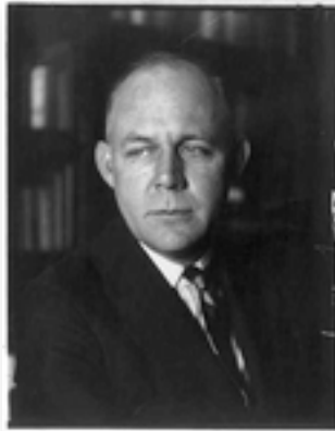
Portrait of Grantland Rice, c1931.

Around the turn of the century it was not uncommon for political cartoonists to have a lot of influence, but Darling's influence went beyond his readers. Some of the most prominent people in the world found him intriguing and brought him into their social or political circles. Starting in the early 1900's, Darling knew Grantland Rice - a Pulitzer Prize winning sportswriter - well enough to stay in his New York apartment. During World War I, Darling met Herbert Hoover . That meeting was the start of a friendship that made J.N. one of Hoover's unofficial Presidential advisors and lasted until Darling's death in 1962. Joseph Stalin - leader of the Soviet Union - personally invited Darling to visit Russia in 1932, and the two ate lunch together in Stalin's hometown. In 1934,