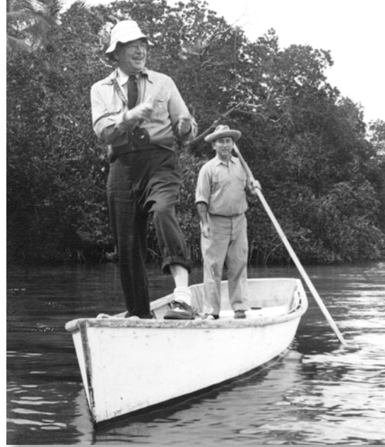
Jay Darling fishing with his trusted guide Belton.

"Land, water and vegetation are just that dependent on one another. Without these three primary elements in natural balance, we can have neither fish nor game, wild flowers nor trees, labor nor capital, nor sustaining habitat for humans." - Jay N. Darling